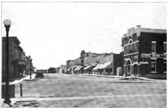
VIEWS OF MAIN STREET, THOMPSON